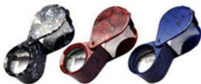
Black Brown Blue

Available in Different Finish & Colours (Black, Brown, Blue, Green, Red, Yellow etc. etc.).