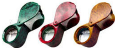
Green Red Yellow

Available in Different Finish & Colours (Black, Brown, Blue, Green, Red, Yellow etc. etc.).